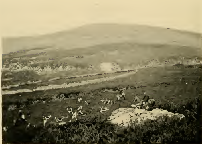
UNDER BIRCH TOR